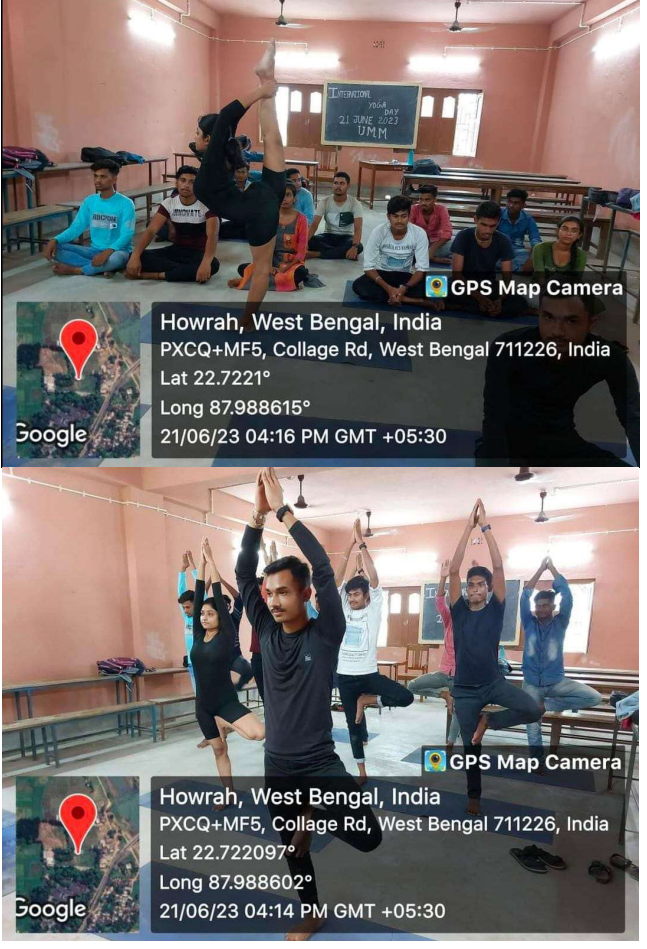
Celebrated YOGA DAY